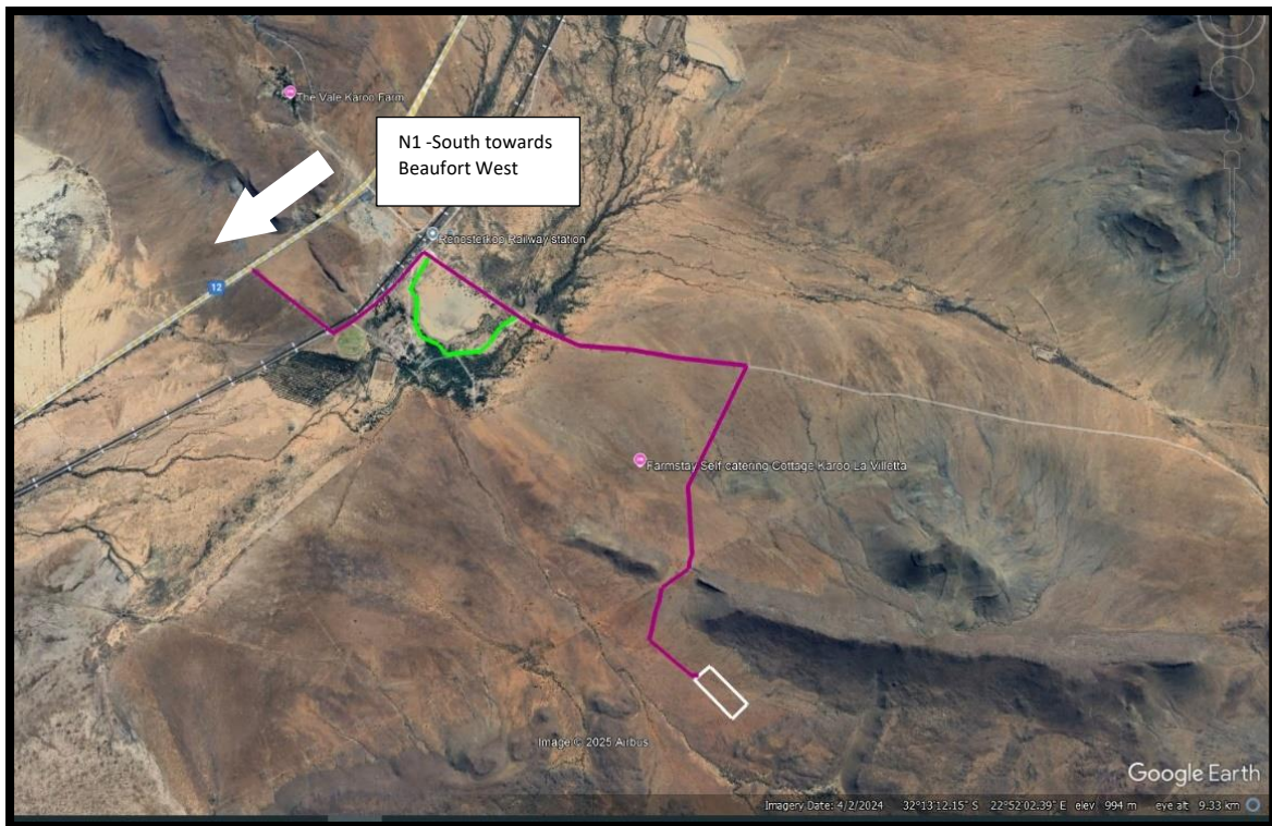
Figure 1: Satellite view showing the access road entrance with (purple polygon), (green polygon) is an alternative option when the dam is at full capacity and the proposed mining area site alternative 1 (white polygon) no alternative was identified for this site.

A total of 33 alien plant species have been recorded within the extracted area, with 9 of them being listed invasive species within the NEM:BA A&IS Regulations, namely: